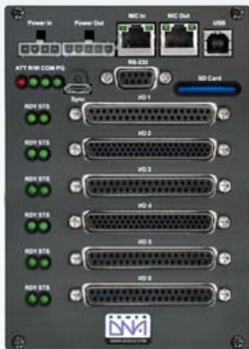
UEI Logger 600

The UEI Logger™ is a powerful, flexible and easy-to-use data logger/ recorder suitable for use in a wide variety of industrial, aerospace and laboratory applications. The Logger contains the controller, network and SD card interface, power supply and either 3 or 6 I/O slots (UEI Logger 300 or 600 respectively).