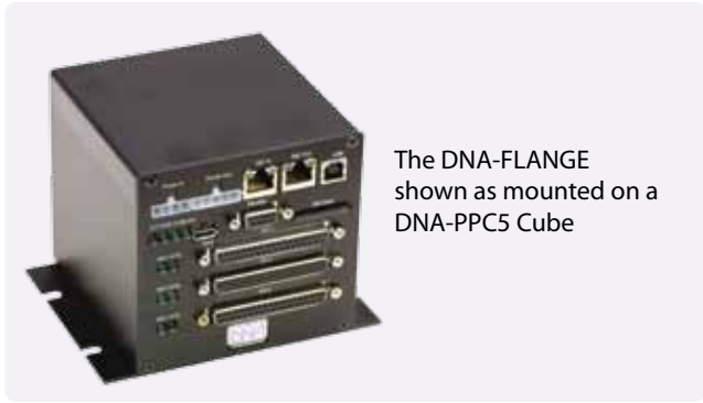
The DNA-FLANGE shown as mounted on a DNA-PPC5 Cube