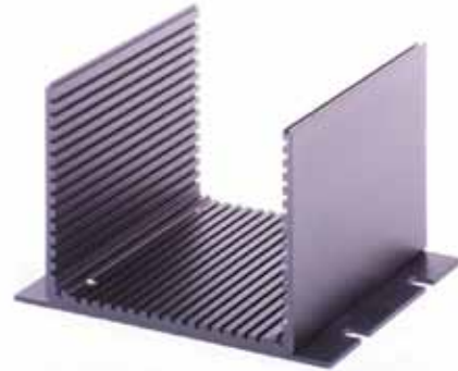
The DNA-FLANGE includes both the mounting base as well as the bottom part of the Cube chassis. We recommend you order the DNA-FLANGE at the same time you order your Cube and we'll install the FLANGE for you. Of course you are free to order it separately or after the fact and install the flange at your facility. Note the standard Cube base does not include the mounting holes for the flange so you will need to "open" up your cube to add the DNA-FLANGE

When the DNA-FLANGE is ordered at the same time as the Cube itself, UEI automatically installs the flange mount base. Should you decided after you have already received your Cube that you'd like to add the DNA-FLANGE, it is easy to modify the Cube to add the flange. You are also free to send your Cube back to us if you'd prefer we add the flange to your existing Cube.