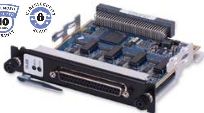
DNR-VR-608 for use in RACKtangle™/FLATRACK™ chassis. DNA-VR-608 boards are for use in Cube chassis.